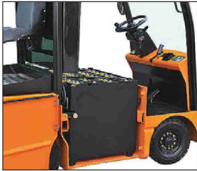
Side-exchange battery design is convenient for changing battery.