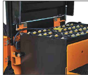
The battery cover can be fully opened , the design is easy for maintenance.