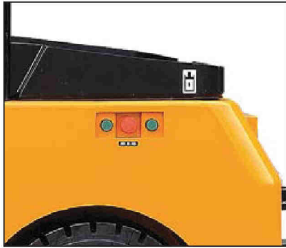
Forward/Reverse inching switch and emergency stop are mounted on the left rear, them make the hook easy and safe.